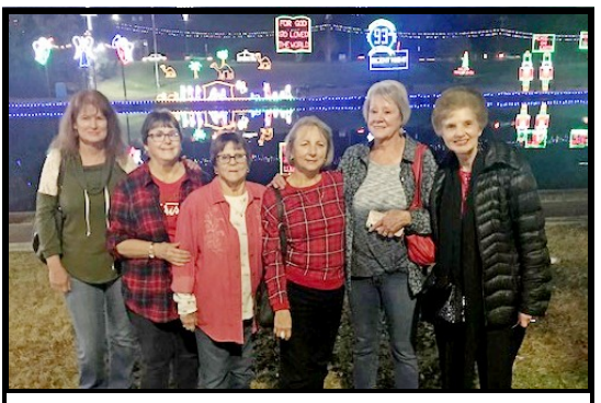
Fellowship& Card Signing @ Pam's